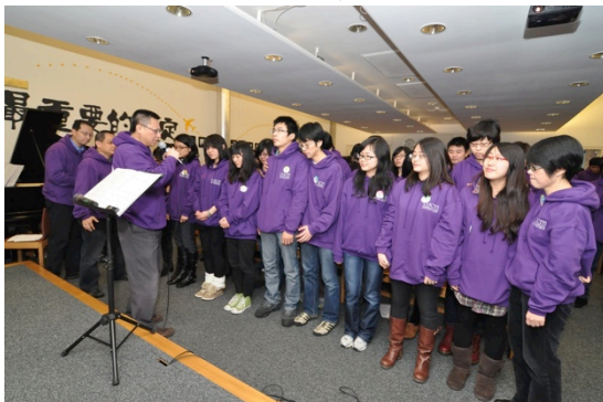
Those who raised their hands came to the front 那些舉手決志的同學走到台前