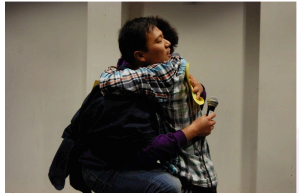
The modern adaptation of prodigal son by the students 學生們演繹現代版浪子回家的故事