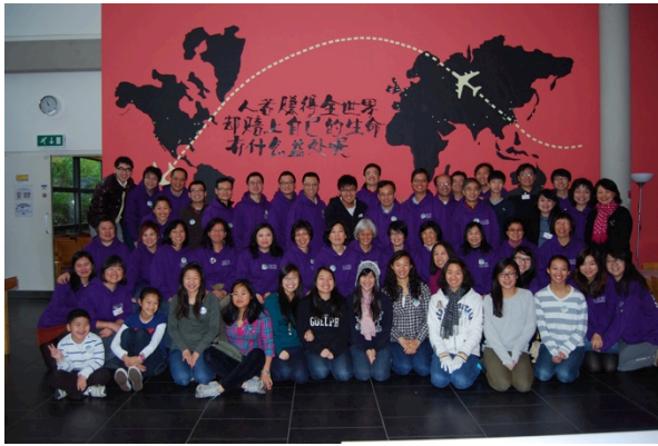
All short-term mission team members and COCM staff workers 服事兩個營會的所有短宣隊員和COCM同工們