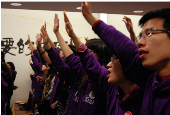
Worshipping our Lord together 一同敬拜我們的主