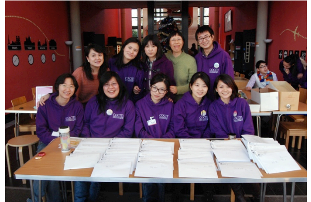
A group of young people serving together with COCM 一群年輕人在營會中幫助COCM一同服事