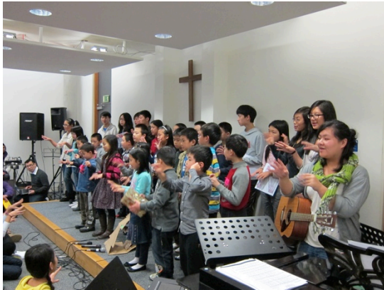
The children's performance after the camp 孩子們在營會結束後的彙報表演