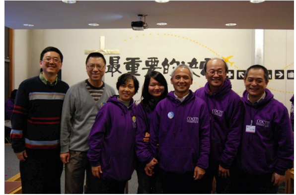
The parents of a student came to Christ in the first camp 一位學生的父母來英國探親期間在營會中信主